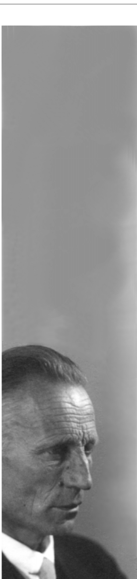
Luitzen E.J. Brouwer