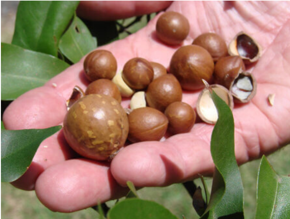
Different nut sizes from Nuts from Macadamia integrifolia and M. jansonii.